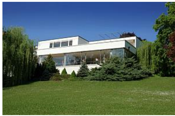
Brno, Tugendhat Villa – a part of UNESCO world heritage