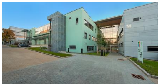
The "M" building, where the conference will take place