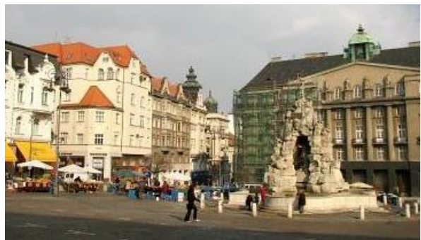
Brno, Cabbage Market

Brno is known as a venue of various scientific, cultural and sports events. One of the Motorcycle World Championship races takes place at the Brno Racing Track every August. Brno has an excellent road, train and bus connection and the international airport Tuřany with regular connections to London (Stansted, Luton), Munich and Eindhoven. Luxury buses of Student Agency Co. connect Brno directly with airports in Vienna and Prague. City transport operates 12 tramway lines, 13 trolleybus lines, 43 bus lines, 11 night bus lines and 1 ship line.