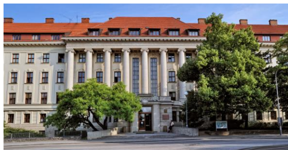
The main building of the Mendel University in Brno (built 1915)