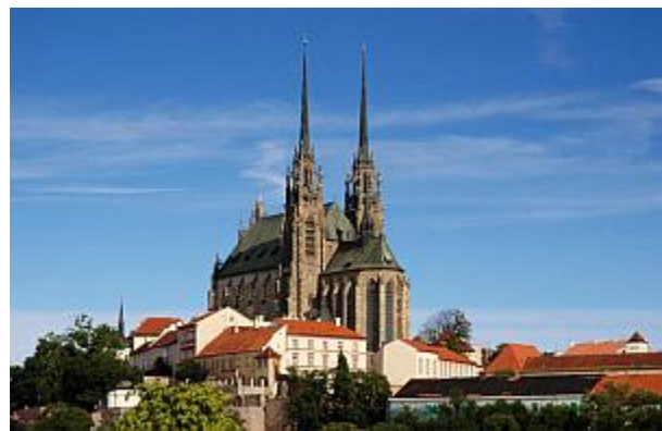
Brno: St. Peter and Paul Cathedral