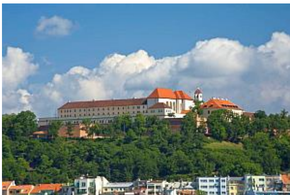
Brno: Špilberk castle