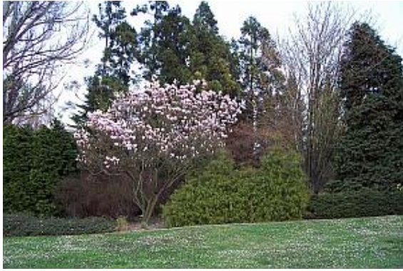
Mendel University in Brno, the Arboretum