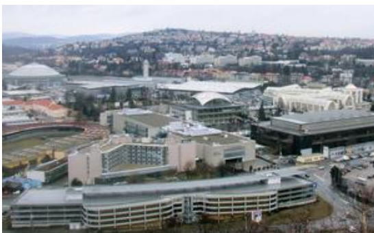
Brno, Fair grounds

Brno - the metropolis of historical Moravia and the second largest city in Czechia - has population of ca. 400.000 inhabitants. Its modern history is more than 800 years old. The city has always been an important trade, administrative, transport and cultural centre. It was one of the first industrial points of the former Austrian-Hungarian Monarchy. At the present time, the educational function represented by 84.000 university students is the most important in the city. This potential is completed along with 13 institutes of the Czech Academy of Sciences and the Czech Technological Park. Social infrastructure includes 6 public and state universities, 15 colleges, 12 hospitals, 14 theaters, 38 galleries, 16 museums, 60 churches, 43 public libraries and a zoo. The commercial tradition is represented by Brno Trade Fairs (40 different types of events with 740,000 visitors per year).